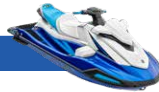
VX® LIMITED HO