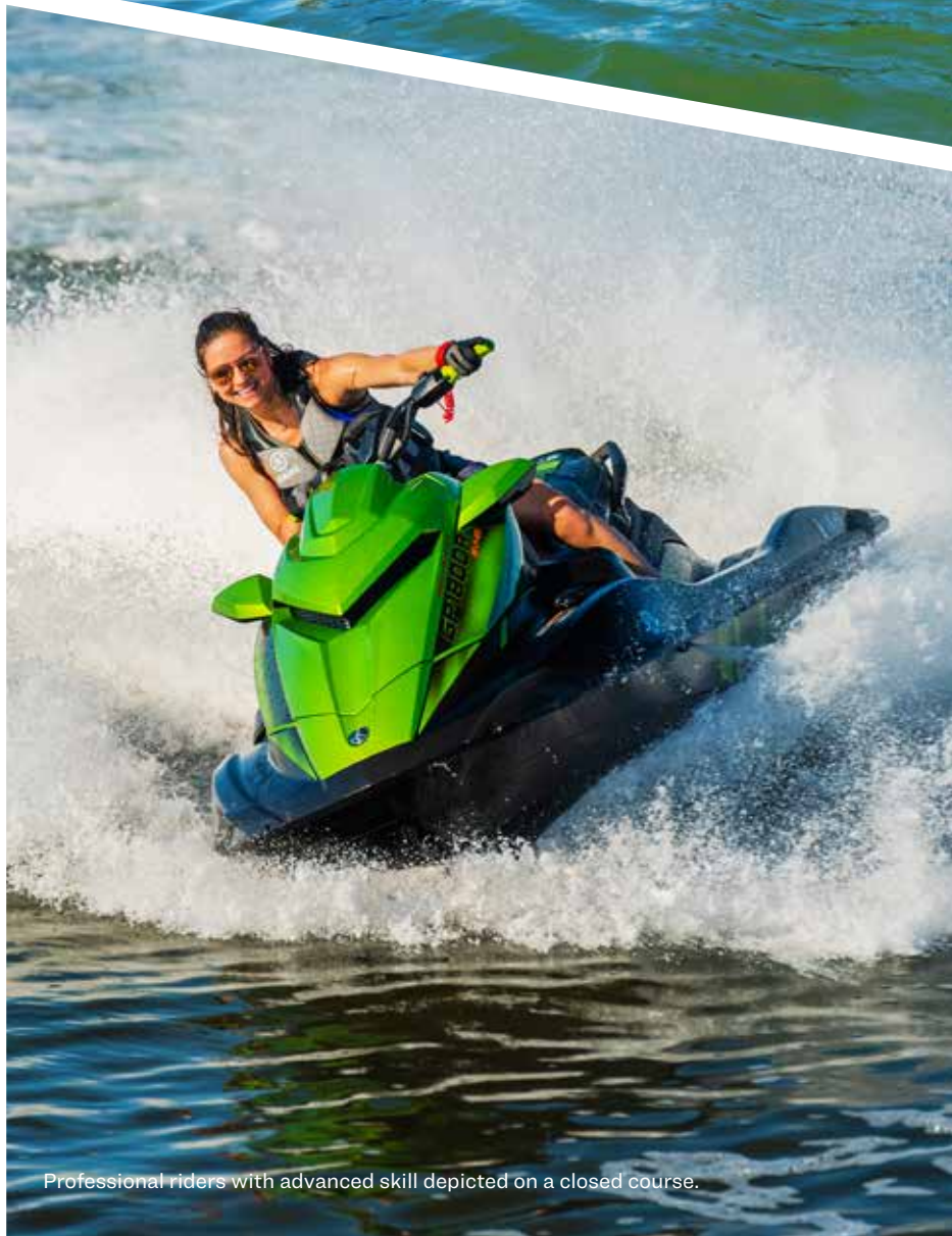
Professional riders with advanced skill depicted on a closed course.