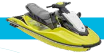
EX ® SPORT