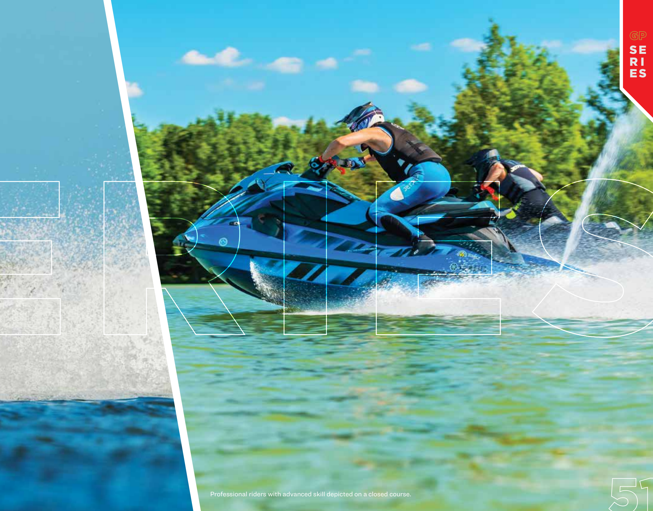
Professional riders with advanced skill depicted on a closed course.