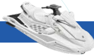
VX CRUISER® HO