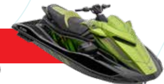
GP1800 ® R SVHO ®