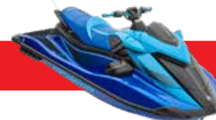
GP1800 ® R HO