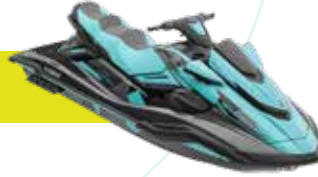
FX® LIMITED SVHO®