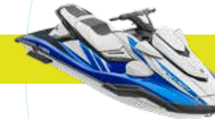
FX ® HO