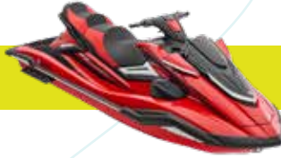
FX CRUISER SVHO®