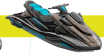
FX CRUISER ® HO